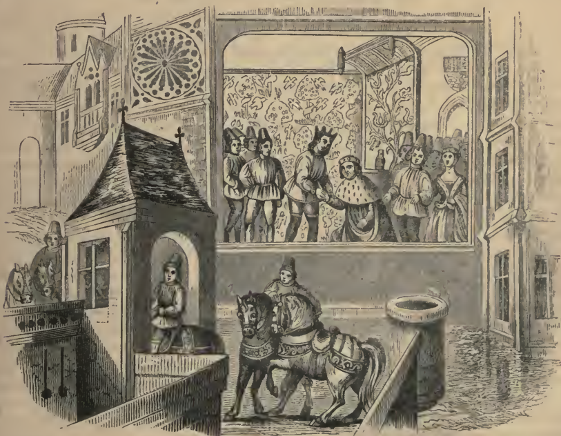
VISIT OF RICHARD II. TO HIS UNCLE, THE DUKE OF GLOUCESTER, IN HIS CASTLE AT PLESHEY. From MSS. of the 15th Century.

King Richard treasured up all these speeches in his mind, and pondered over them continually. Shortly after the departure of his two uncles of Lancaster and York, he summoned up more courage than usual, and said to himself, that it would be better he should destroy than be destroyed, and, that, within a short time, he would hold his uncle of Gloucester so securely, he should be incapable of injuring him. As he could not accomplish this alone, he opened himself to those most in his confidence. It was to the earl marshal, who was his cousin, and also earl of Nottingham, that he discovered his intention, and most minutely gave him his orders how he was to act. The earl-marshal, from the favours he had received, loved the king in preference to the duke of Gloucester, and kept the secret he had been entrusted with from all but such as he was forced to employ, as he could not do the whole himself. What I am about to say will explain the matter.